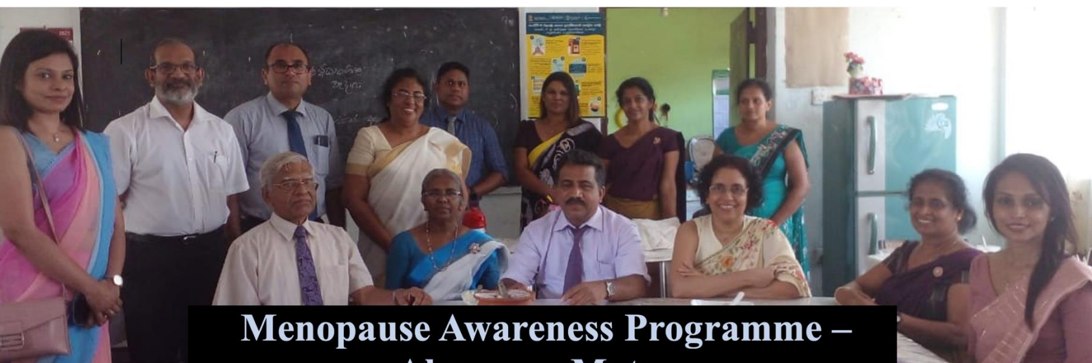
Menopause Awareness Programme – Akuressa, Matara